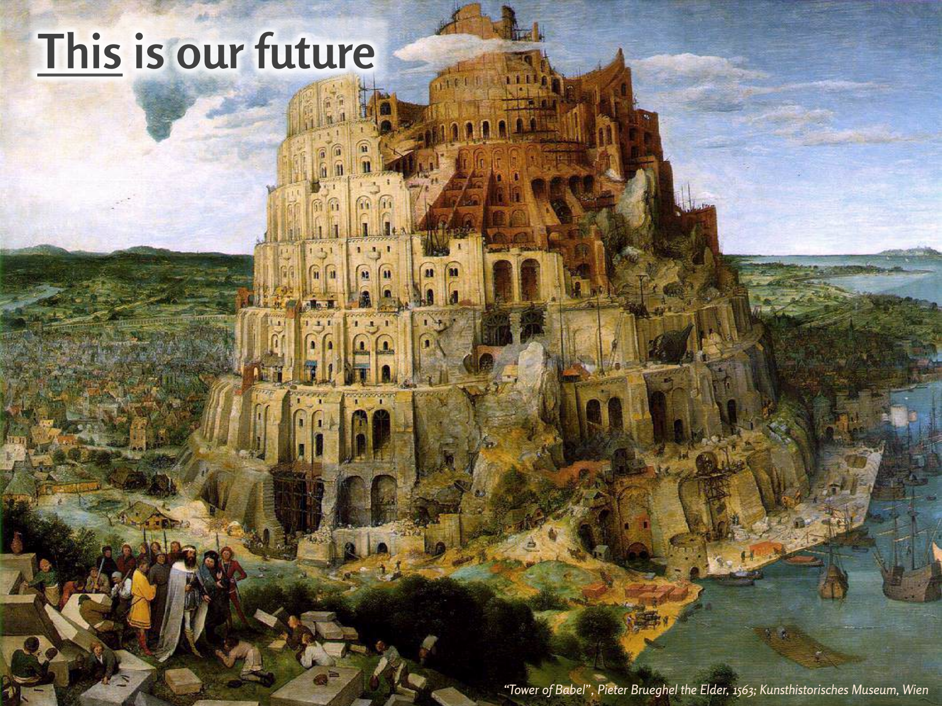
"Tower of Babel", Pieter Bruegel the Elder, 1563; Kunsthistorisches Museum, Wien